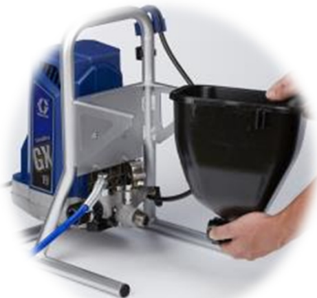
1. Remove Hopper