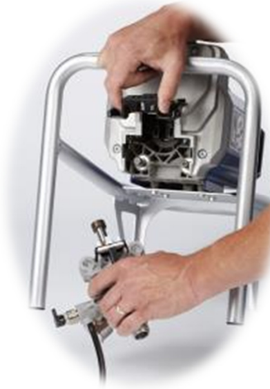
3. Remove pump