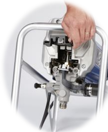
2. Unlatch & Lift Door