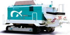
ETP970 Crawler Type